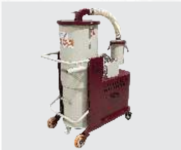
Industrial Vacuum Cleaner wet & Dry