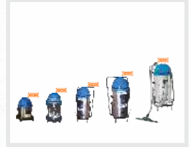
Wet And Dry Vacuum Cleaner