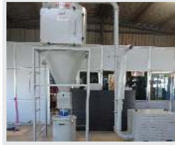
Centralized Vacuum Cleaner