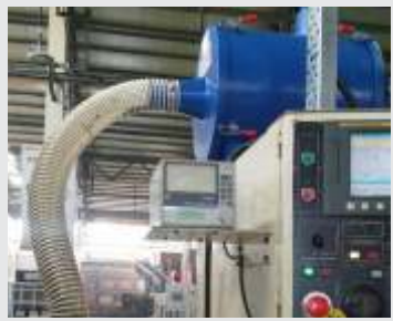
CNC Oil Mist Collector