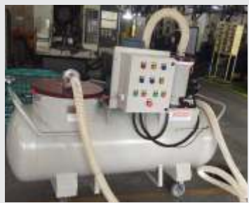
Oil Sump Cleaner