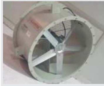
Axial Fan Blower