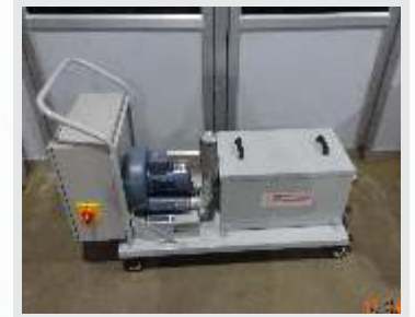
Hot air Blower