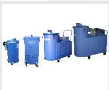
Three phase dry Vacuum Cleaner