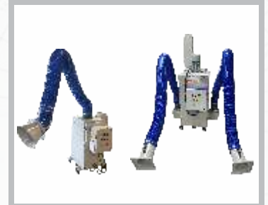
Welding Fume Extractor