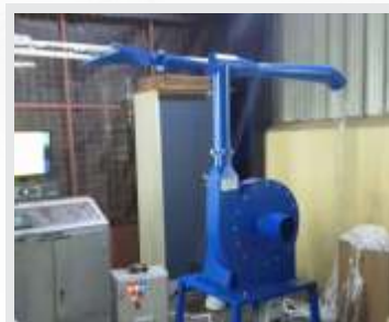
Trim Suction Unit