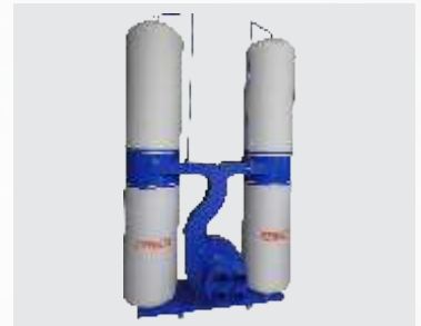
Wood Dust Collector